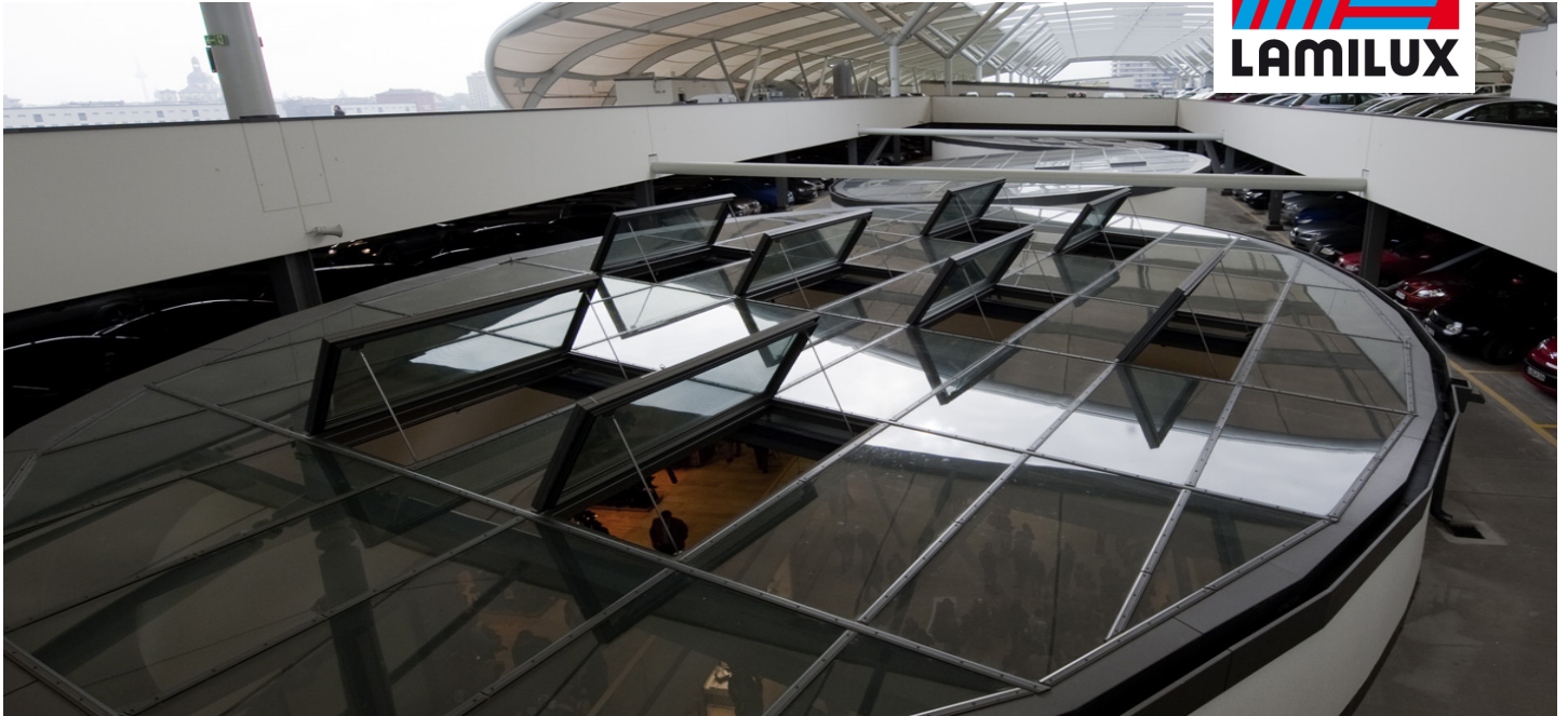
Rhein-Galerie, Ludwigshafen, Germany